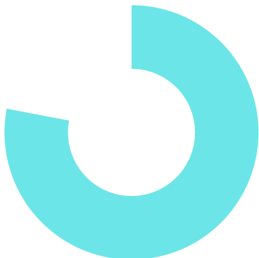
CRIMINAL ACTIVITY WITHIN FAMILY 78%