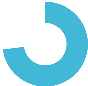
PRIOR CPS INVOLVEMENT 73%