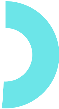
WITNESSED DOMESTIC ABUSE 51%

THE CHILDREN WE SERVE EXPERIENC MUCH ADVERSITY. IN 2023-2024, THE CHILDREN CASA SERVED EXPERIENCED: