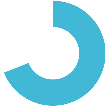
ECONOMIC INSTABILITY 69%